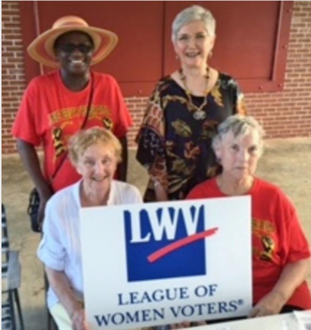
LWV OF NATCHITOCHEES ( A MAL UNIT)

widespread viewing, and, true to a league cornerstone, a new registered voter!